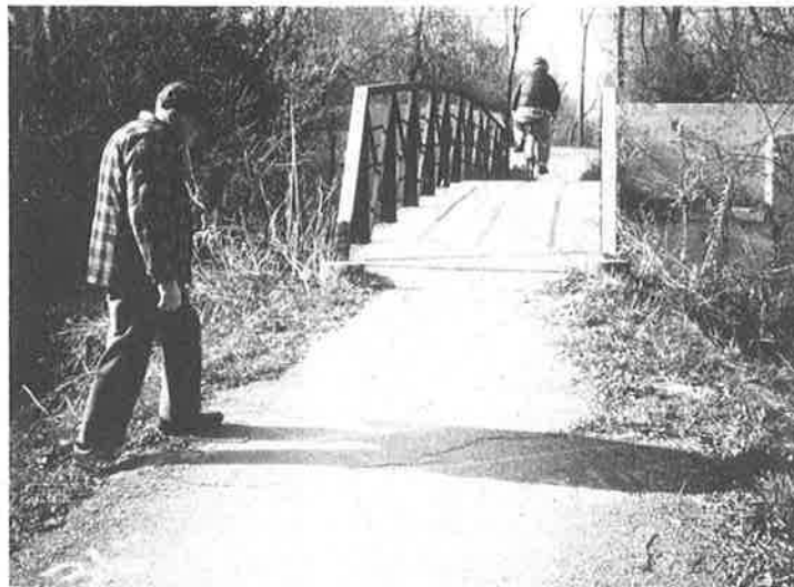
The narrow bridge on the IPP Main Stem at the East Branch of the DuPage River is scheduled to be replaced by DuPage County.

rah is developing a trail improvement plan for the county trail system (the Illinois Prairie Path and the Great Western Trail) in consultation with all types of trail support groups and trail users including bicyclists, runners, hikers, equestrians and skiers, as well as adjacent landowners.