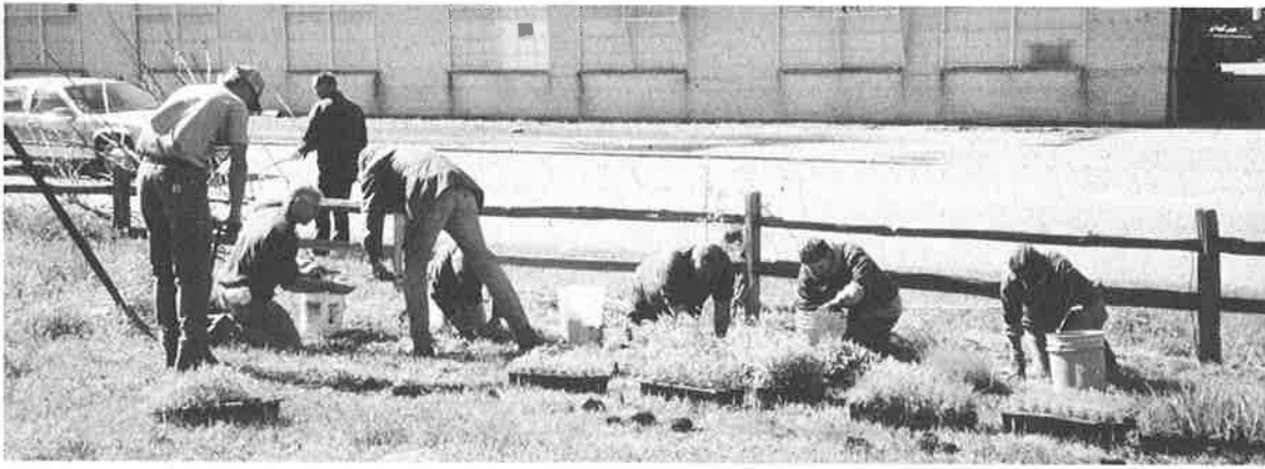
Bellwood Centennial Prairie volunteers worked to install over 1,000 prairie plants in May 2000.