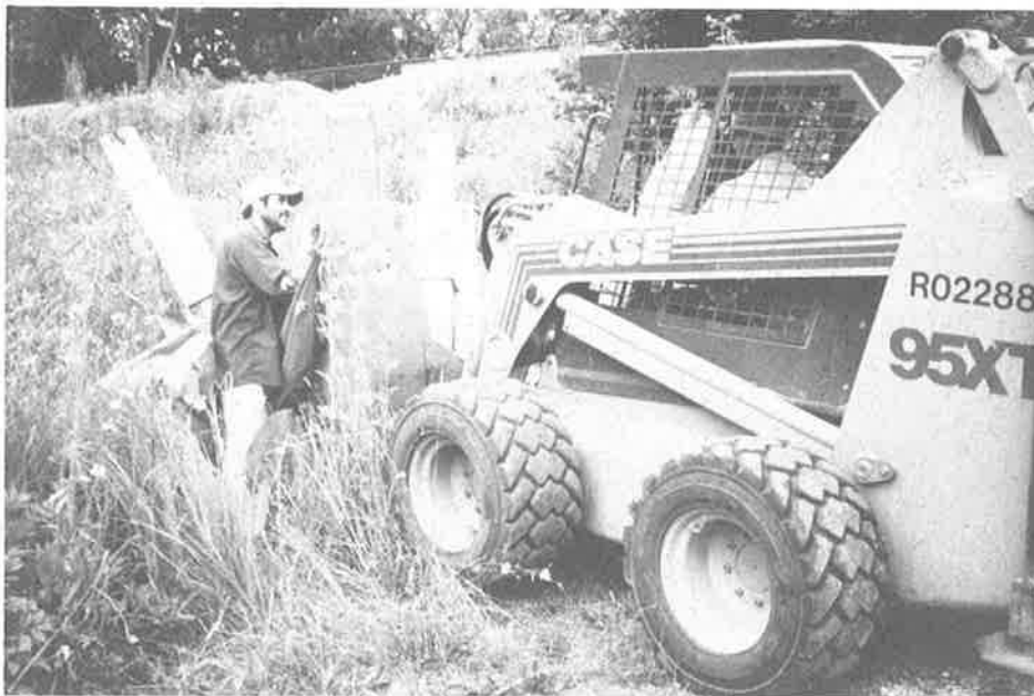
The Conservation Land Stewardship Company, contracted by the county, transplanted large plugs of prairie grasses and forbs from Taylor Avenue prairie to a site south of Crescent Blvd. in August 2000.

routed along village streets. A hitch interrupted the early construction schedule. When the contractor started to excavate the foundation for the bridge abutments, he found that a fiber optic cable had been installed under that exact location, though the records said it was several yards to the north. Construction was halted until the line was moved.